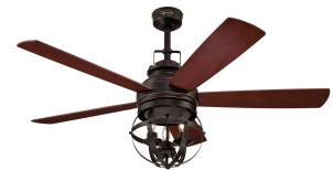
Reversible Catalpa Wood Finish Blades